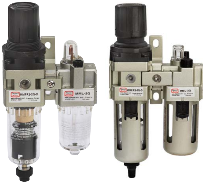
MMFRS-2Q-D Stacking FRL with Polycarbonate Bowls and Auto Drain